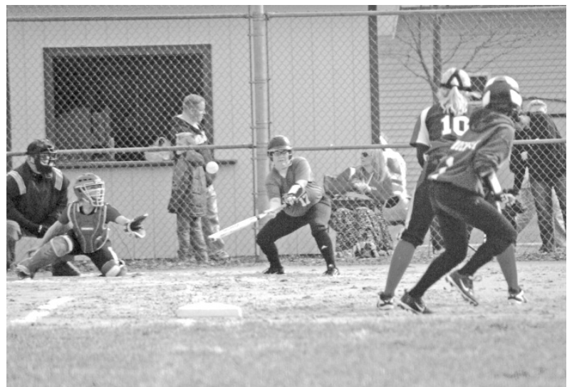
The Ellsworth offense looks to advance a runner on this play in the top of the fourth inning against East Jordan.

In the nightcap, Ellsworth scored twice in the top of the first three innings, while limiting East Jordan to a pair of runs over the same time